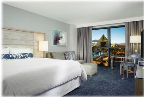
New room design for the Swan (758 guest rooms)